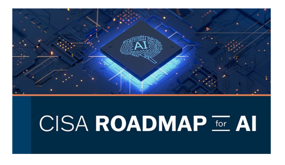
Artificial Intelligence | CISA