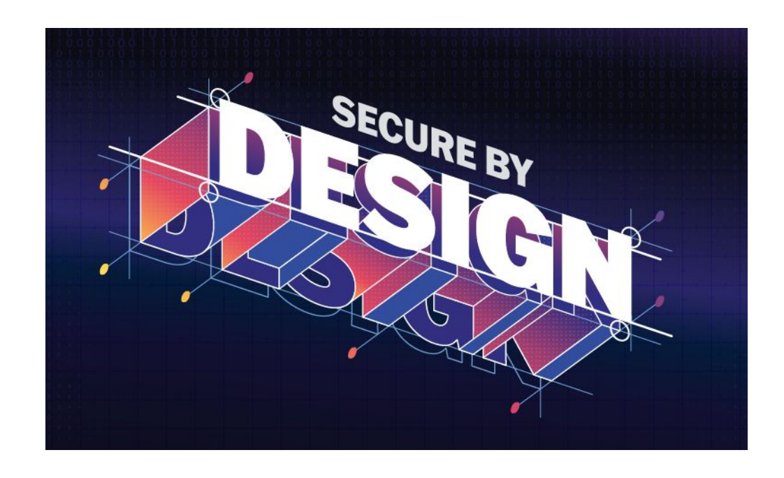
Secure by Design | CISA